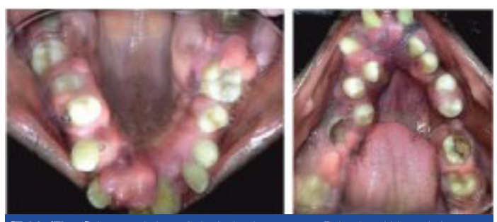
[Table/Fig-4]: Intra oral view of gingival enlargement - Palatal and Lingual view

[Table/Fig-3]: Intra oral view of severe gingival enlargement – Buccal view